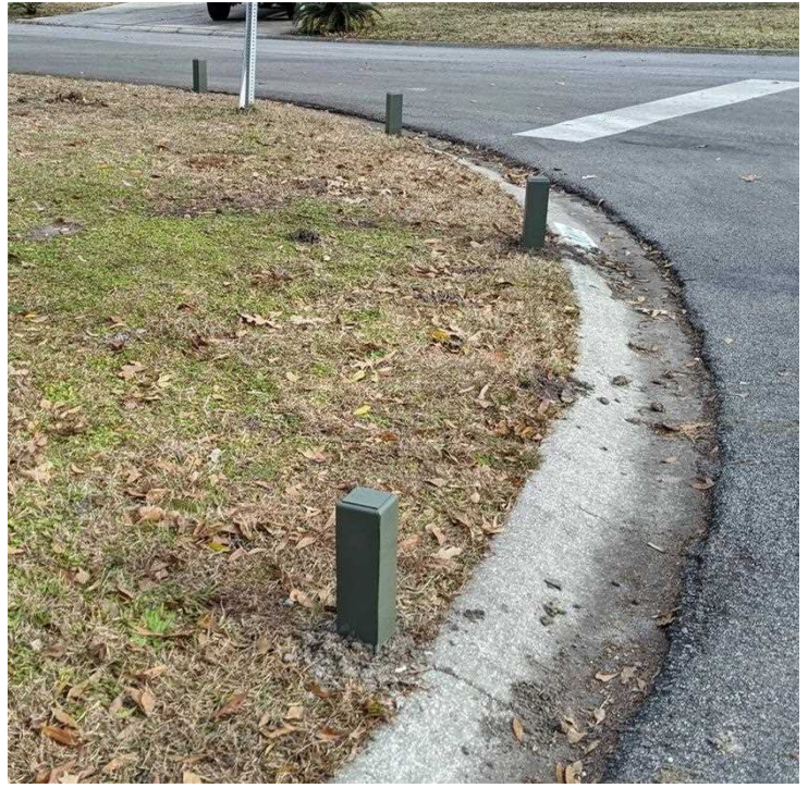
Typical Post Installation with spacing of 6' to 7' between posts