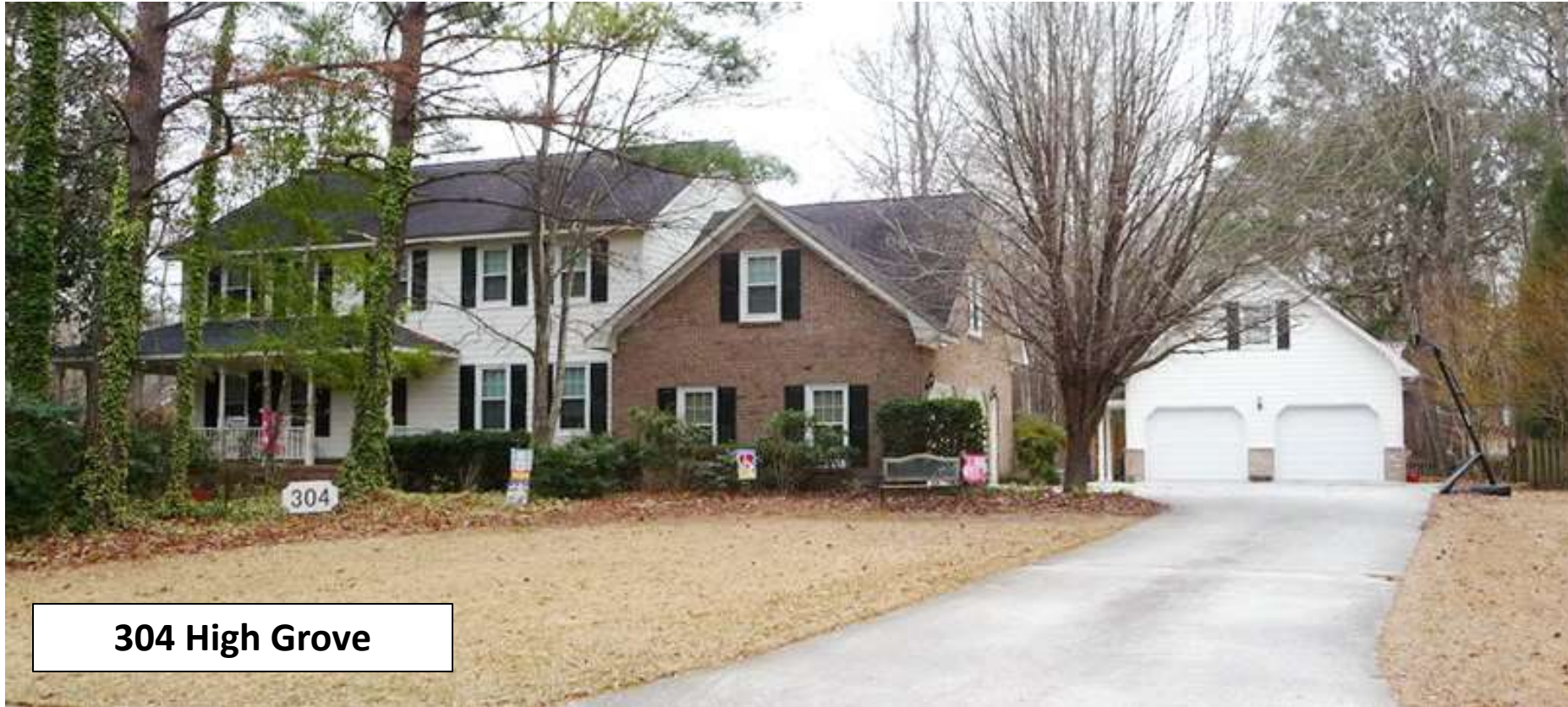
304 High Grove